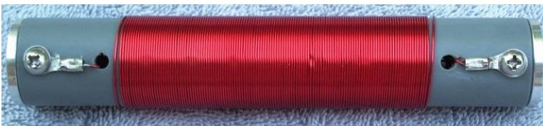
The Completed 80 meter coil

Once you are happy with the coil you may choose to crimp or solder the wires to lugs or leave as is.